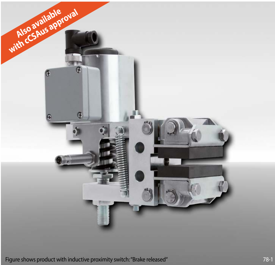
Figure shows product with inductive proximity switch: "Brake released"

spring activated – electromagnetically released